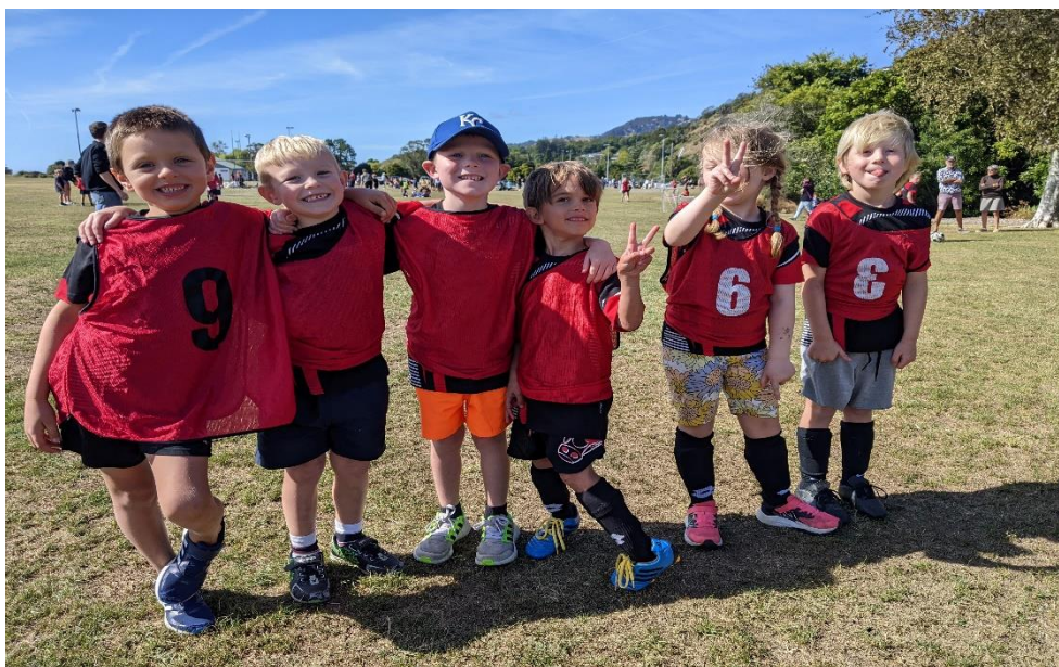
HSS Piwakawaka Summer Soccer Team