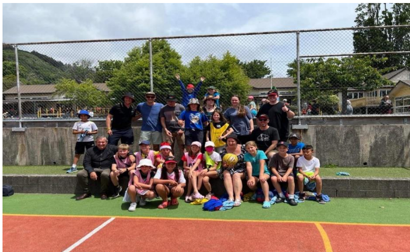
Staff vs Students basketball game