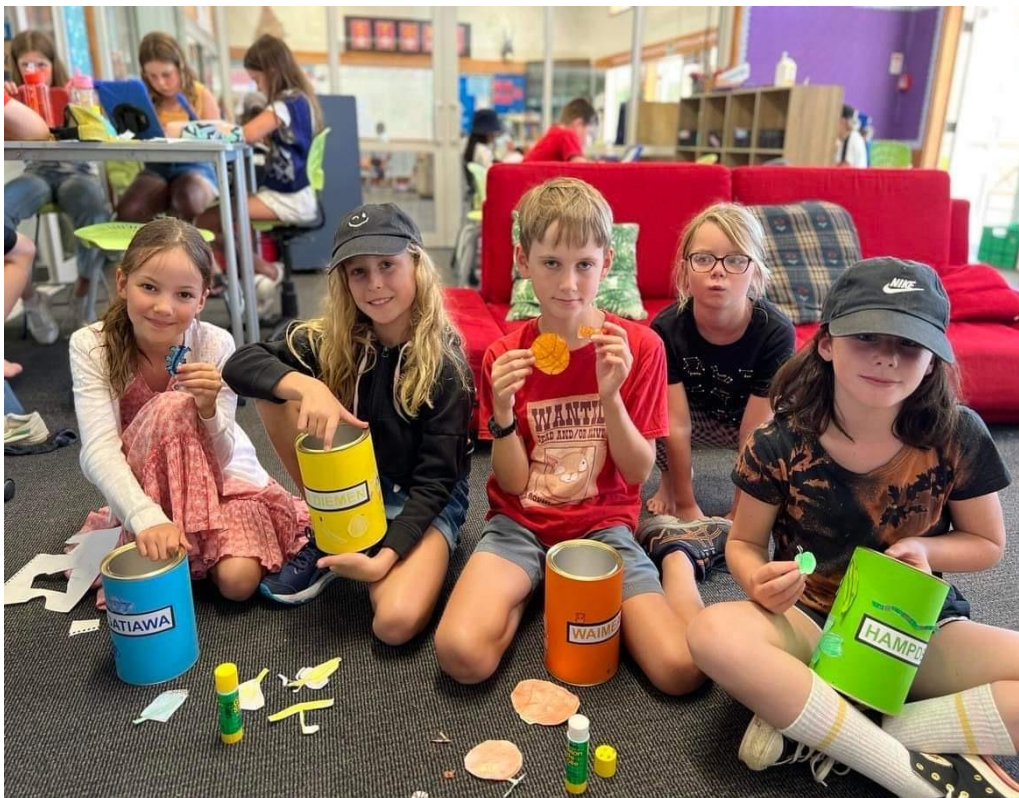
Room 6 Making STARS Token Collection Tins

Piki ake ki ngā whetū - Reach for the Stars